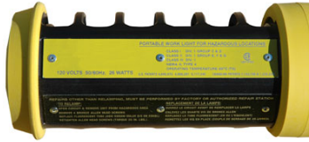
Click Photos to Enlarge