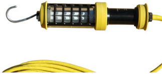
Click Photos to Enlarge

This 26 watt fluorescent light is suitable for use in areas where petrochemical vapors and various dusts are present and projects 1,740 lumens of light, roughly equivalent to a 100 watt incandescent bulb as estimated by Sylvania. Fluorescent lights are popular in paint prep, painting and post-paint inspection operations due to the even white color light produced. Incandescent lights tend to create yellowish, shadowy light that confuses the eye and makes it difficult to examine a work area with consistency. The light output, color and evenness of coverage make fluorescent lights popular for a wide variety of close quarter work and inspection activities. This unit is rated Class 1, Division 1 and is complete with 100' of SOOW 16/3 AWG cord ending in a 5-15 straight blade plug that meets federal specification JC-580A.