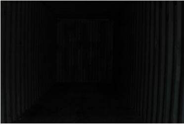
40' Container Dark