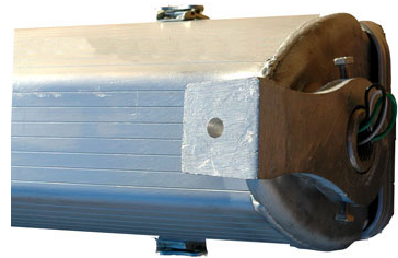
Click Here to Enlarge