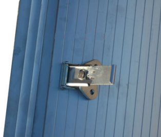
Click Here to Enlarge