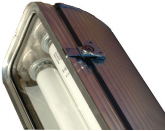
Click Here to Enlarge