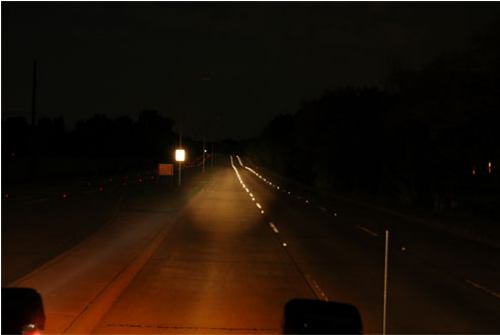
Halogen Golight illuminating a stretch of road about 5000 feet in length. Beam loses intensity after 750'.