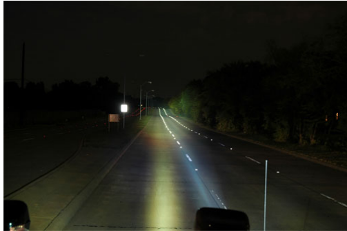
HID Golight demonstrating exceptionally more power than halogen. Golight HID Stryker beam measured to 5,331 feet.